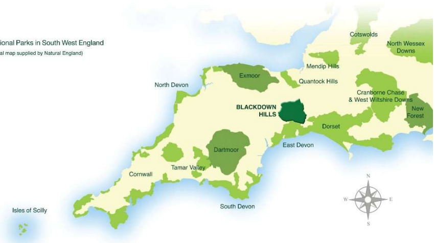
AONBs and National Parks in South West England (Redrawn from original map supplied by Natural England)

To the south, between Honiton and Axminster, the Blackdown Hills AONB shares a boundary with the East Devon AONB, and not far to the east is Dorset AONB. Looking north, there is a strong visual relationship across the Vale of Taunton with the Quantock Hills AONB and Exmoor National Park. A population of around 150,000 live in the towns close to the AONB.